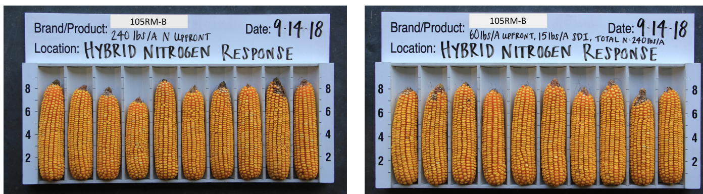
Figure 2. Representative cobs from the all-upfront treatment (left) and the fertigation treatment (right) for the 105RM-B product.