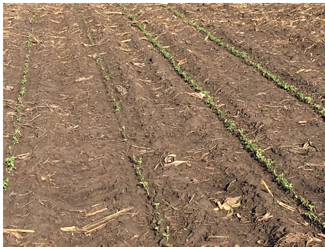
Figure 2. The two rows on the left are untreated, the two rows on the right are treated with Acceleron® Seed Applied Solutions STANDARD.