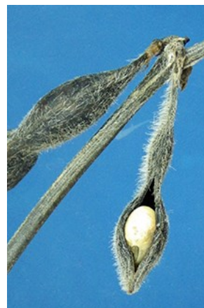
Figure 1. Soybean seed beginning to swell from moisture available through pod wall.