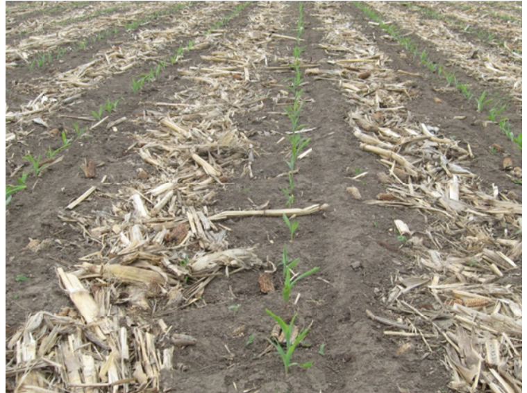
Figure 2. Strip-till may be used to remove residue from the row for avoiding problems with seedling emergence; however, it does not necessarily increase the rate of residue decomposition.

For additional agronomic information, please contact your local seed representative. Developed in partnership with Technology, Development, & Agronomy by Monsanto.