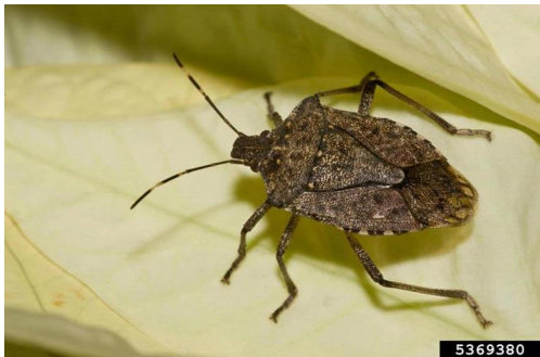
Figure 1. Brown marmorated stink bug.

Damage occurs as stink bugs insert their piercing-sucking mouthparts into plant tissue and suck the plant juices. An enzyme is injected by the stink bug into the plant which aids in digestion. Stink bug feeding damage may result in dead